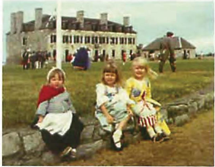
Young Re-enactors at Old Fort Niagara

The annual total tourism expenditure impact is estimated to be $13,894,160. Assuming that 46 cents is spent on secondary sales for every dollar of direct tourist expenditures, the $13,894,160 in direct