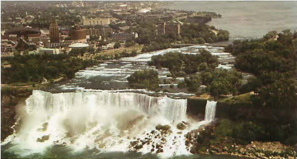
The American Falls