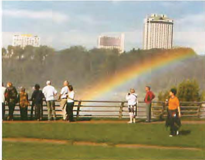
Prospect Point Niagara Falls State Park

propose any specific federal action beyond a recommendation of the Secretary of the Interior to Congress regarding designation, no compliance with Section 106 of the National Historic Preservation Act is needed at this time. If a Niagara National Heritage Area management plan is developed and it identifies specific actions that may have impacts on cultural resources, Section 106 compliance would be covered at that time.