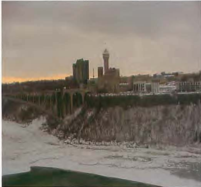
View of the city of Niagara Falls, Ontario, Canada

NPS technical assistance offered through the heritage area could provide support to state and local resource managers that would address a wide range of resource management issues including interpretive programming and materials, public access, carrying capacity, and resource protection.