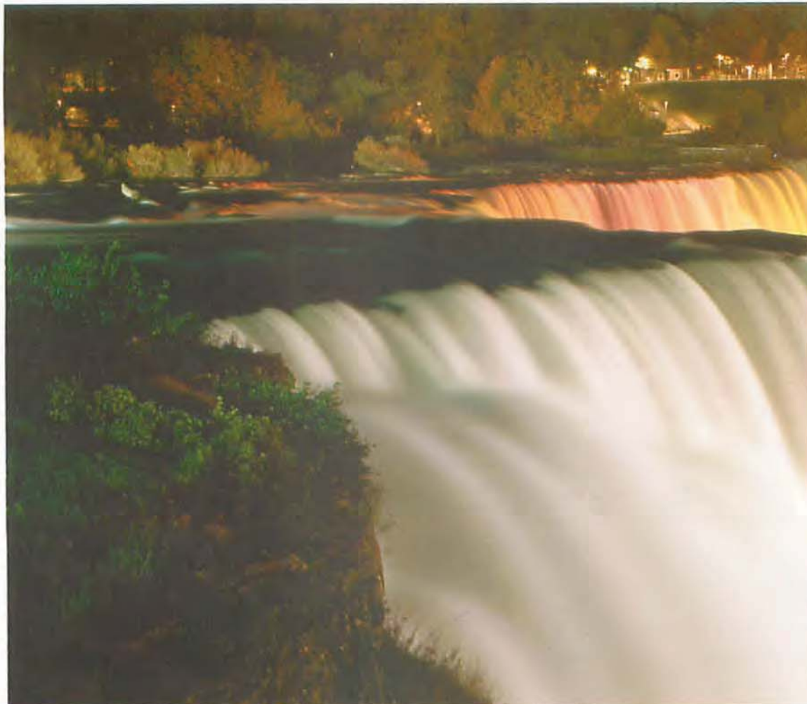
Niagara Falls at Night Time

In November 2003, the study team conducted its first public meeting at the Niagara Falls Arts and Cultural Center. At the session, NPS planners described the study process and related their initial findings in terms of defining the study area, heritage tourism needs, and predominant themes. Over 100 people attended the session and commented on all